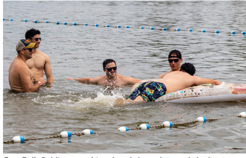
Fort Polk Soldiers revel in a break from duty and the heat.

Those stationed at Fort Riley, in Kansas, don't have to travel to Orlando for the amusement park experience because the base has an Outdoor Adventure Park, which features hatchet-throwing and rope courses, a climbing wall, a golf driving range and softball cages. One high point of the season is the annual Victory Week, which honors the 1917 formation of the 1st Infantry Division (stationed on the base) and includes several sports competitions and ceremonies. This